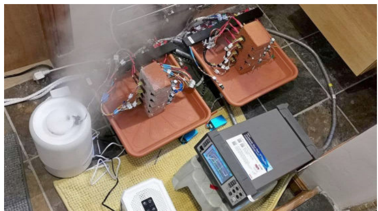
Figure 1: Experimental setup

Then, a series of Sensirion SHT-31A microsensors have been embedded into both bricks, measuring temperature and relative humidity (RH) variations on the surface, in depth, and of the surrounding environment. Both platforms have been placed on individual custom scales, allowing to measure ongoing moisture increases and decreases with less than 0.1g precision. All data has been logged at 18 sec intervals by a Tektronix-Keithley DAQ6510 80-channel professional data acquisition system featuring 6½ digit resolution and 0.0025% accuracy. (Figure 1)